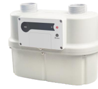
Commercial Ultrasonic Gas meter USM-G25/G40/G65