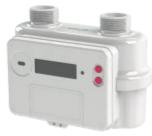
Residential Ultrasonic Gas meter USM-G2.5/G4

Full measurement range cover residential and commercial gas metering applications