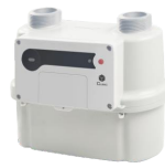
Commercial Ultrasonic Gas meter USM-G6/G10/G16